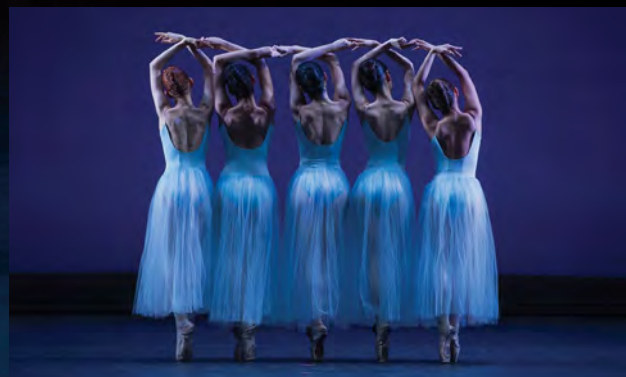
Serenade | Choreography by George Balanchine © The George Balanchine Trust Hong Kong Ballet Dancers | Photographer: Cheung Wai Lok, 2014