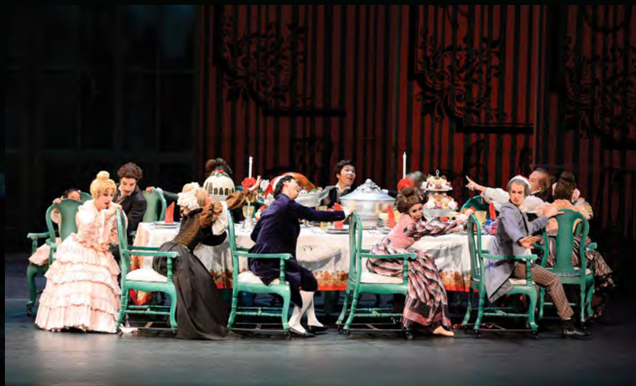
Hong Kong Ballet Dancers