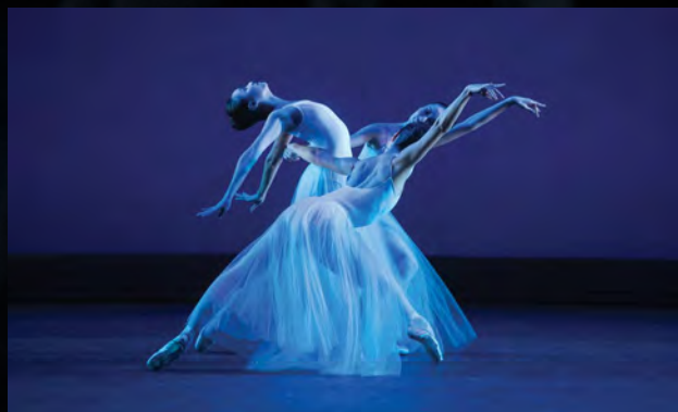
Serenade | Choreography by George Balanchine © The George Balanchine Trust Hong Kong Ballet Dancers

*Work is given by permission of BOSSEY & HAWKES MUSIC PUBLISHER LIMITED.