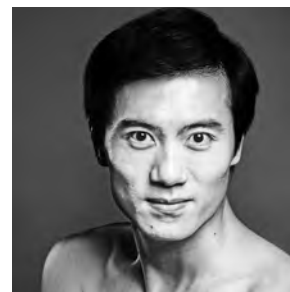
WEI WEI 魏巍