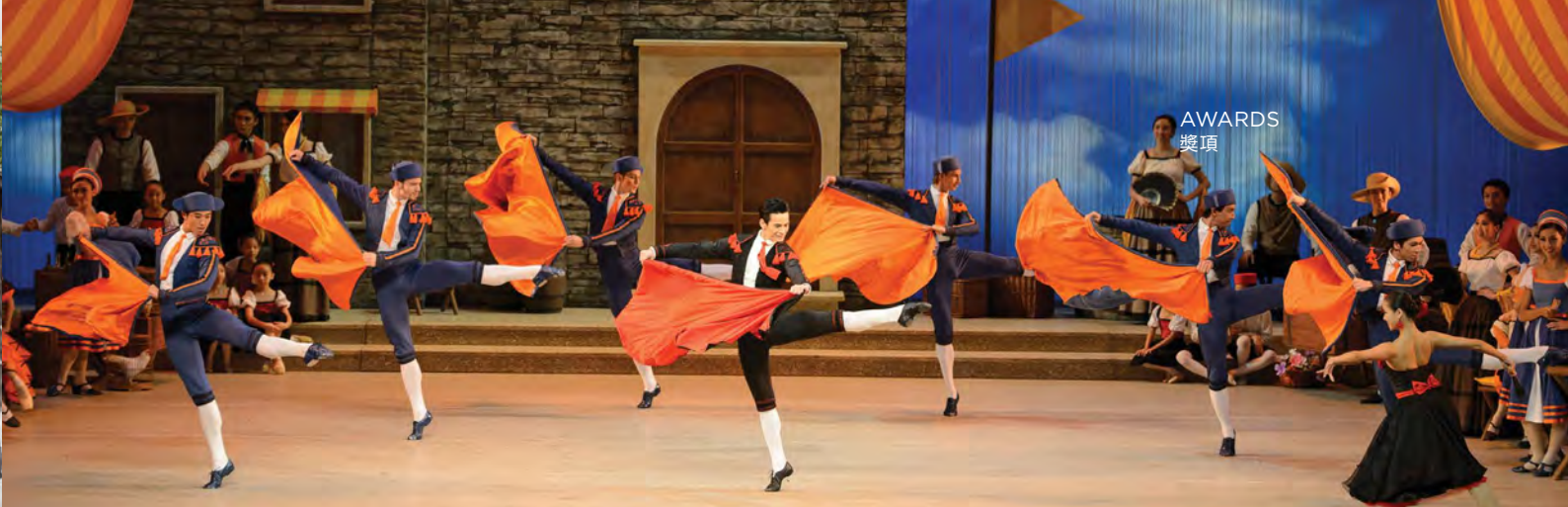
Hong Kong Ballet Dancers