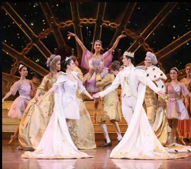
Hong Kong Ballet Dancers